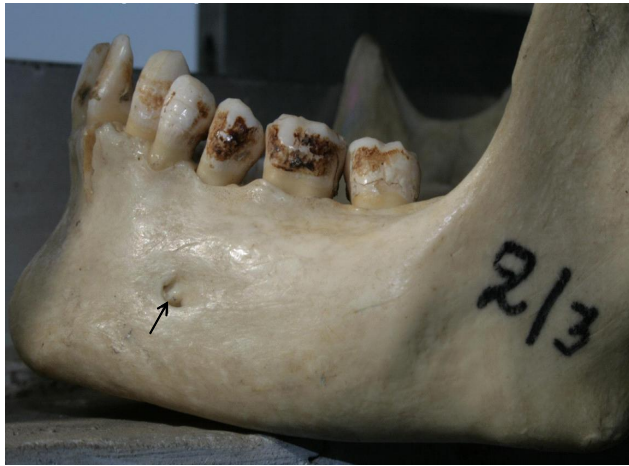
Fig. I: Showing double mental foraman.